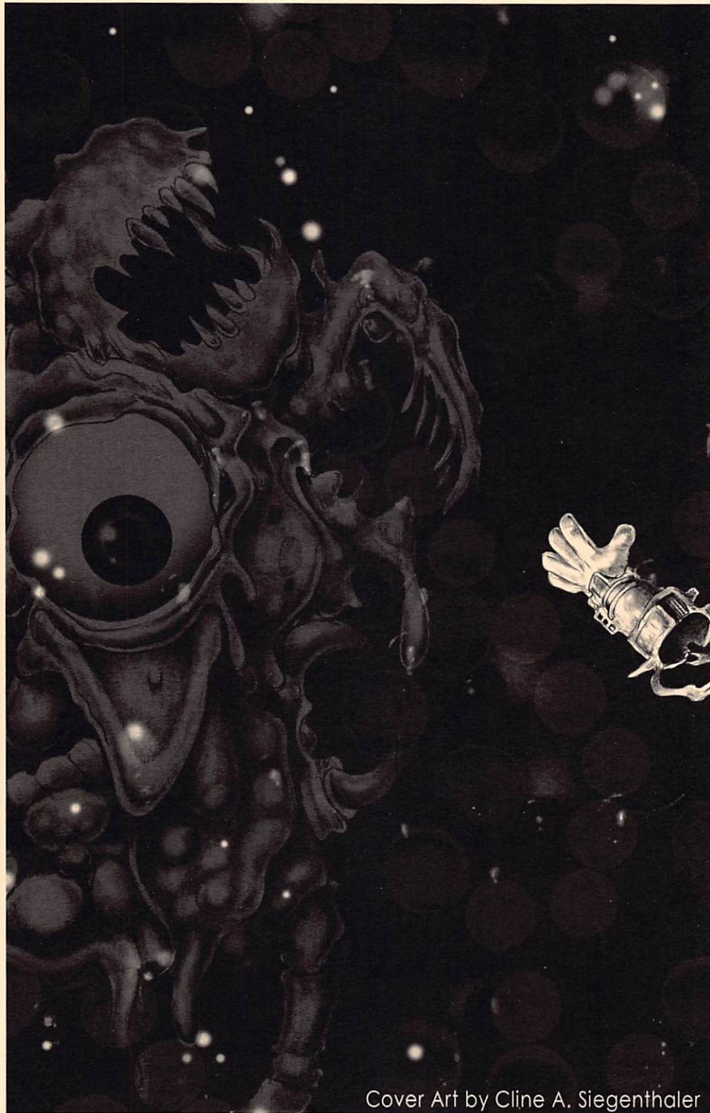
Cover Art by Cline A. Siegenthaler